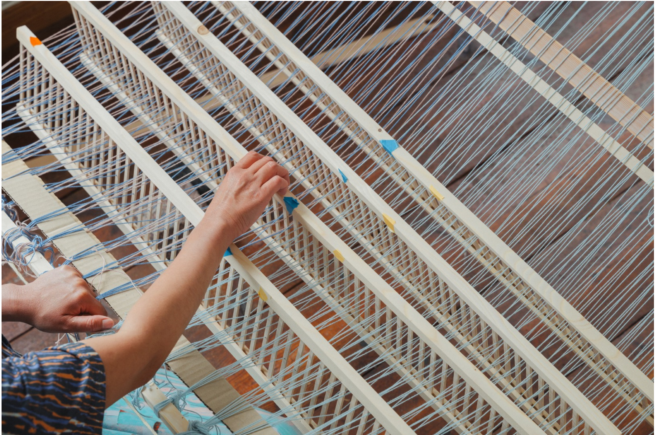
Close-up view of the wooden heddles, Gallery Lennätin 2023