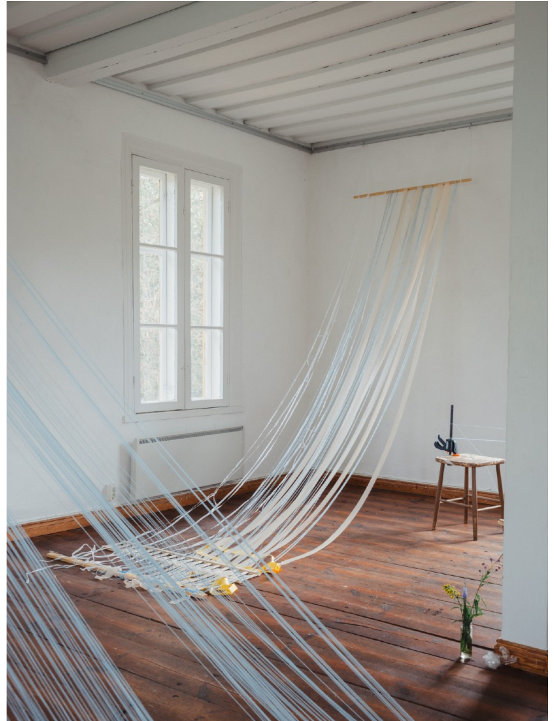
Installation view at the HIAP studio, Suomenlinna, 2022

The solo exhibition B/LOOM! presented an ongoing experimental process in which I tested my self-made wooden heddle systems on the backstrap looms. The wooden heddles are made according to the thickness and density of the warp yarns. Each heddle is made specifically for the designs of the textiles to be woven on the looms.