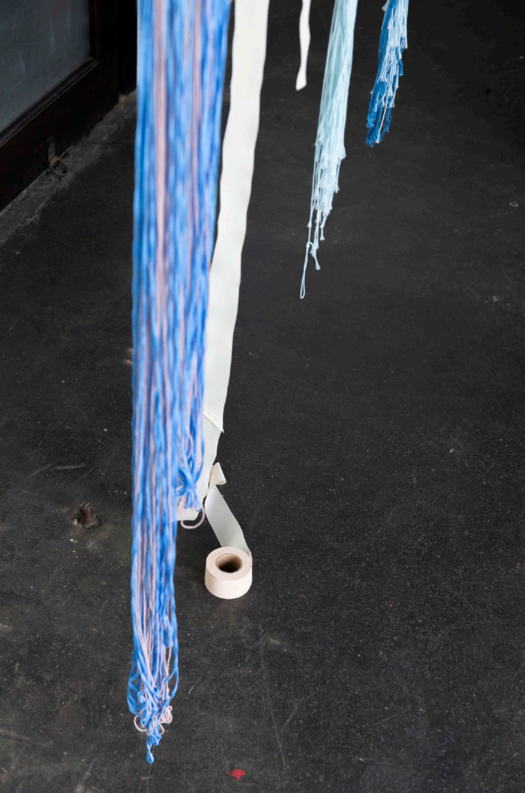
Close-up view at the exhibition Artists' Island