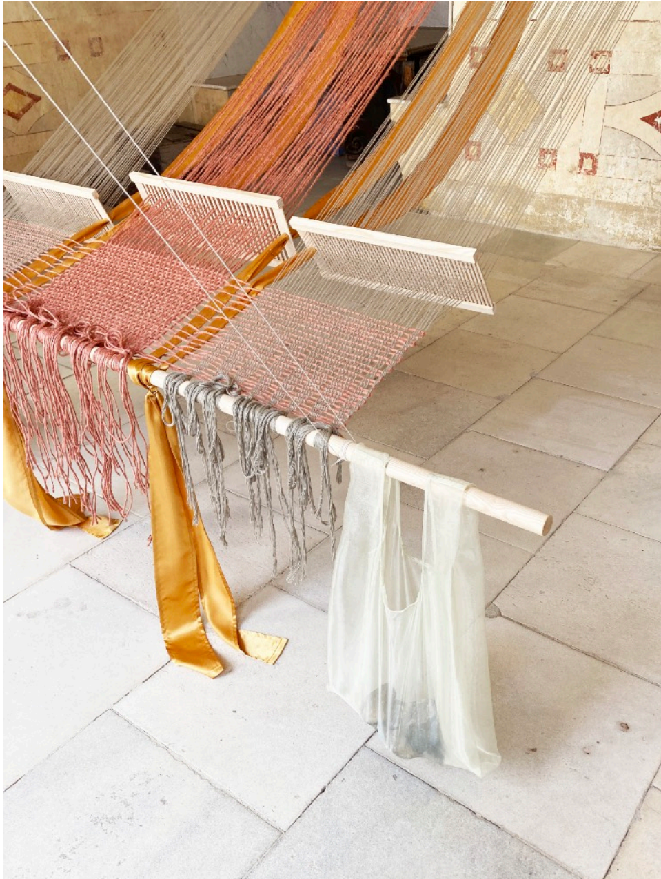
Close-up view at the group exhibition Knit and Weave