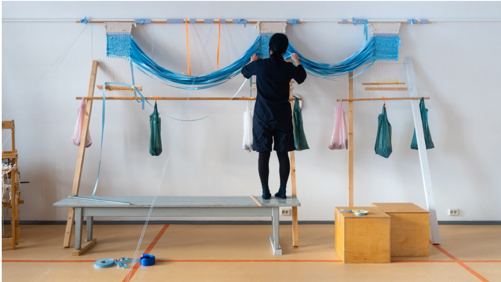
Warp-Weighted Loom (weaving in progress) , HIAP Suomenlinna, 2022

Warp-Weighted Loom is a site-specific loom installation inspired by the Icelandic Viking loom, which used stones as weights attached directly to the warp threads. As a contemporary version, I built simple structures using leftover wood materials and used stones in the plastic bags as weights (instead of drilling holes directly into the stones).