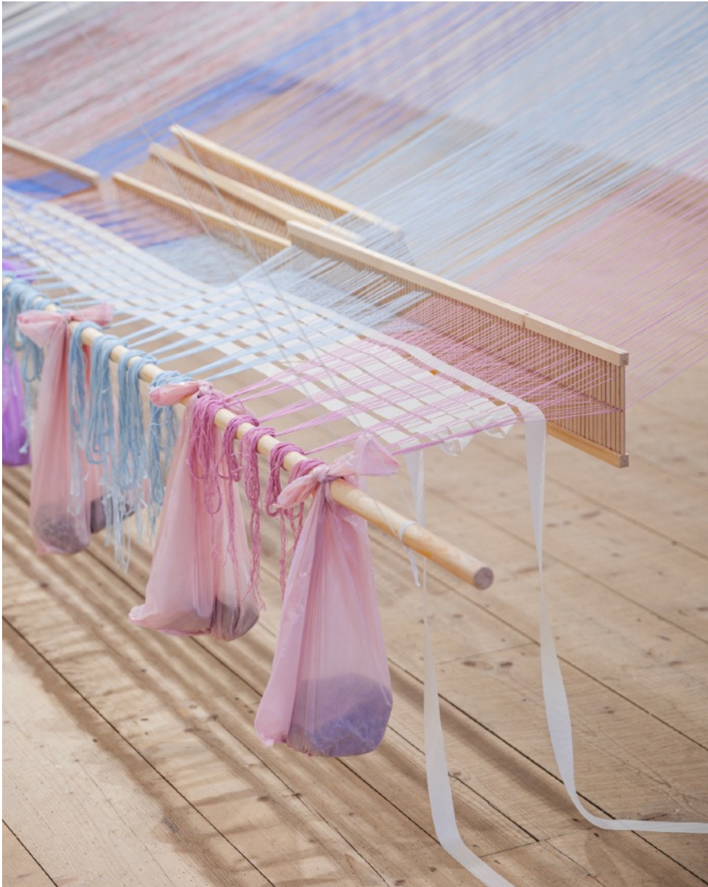
Close-up view (handmade wooden heddles & stones in plastic bags)

NOT BIG ENOUGH is a loom installation built from handmade wooden tools and repurposed yarns, suspended in space. This large-scale loom is developed throughout my artistic research project I AM A WEAVER , in which I explored traditional weaving methods and reinterpreted them with my technical curiosity. The installation, which combines ancient weaving techniques with a backstrap and warp-weighted loom, balances itself between wall structures using stones placed in plastic bags. The idea for the artwork was developed during the artist's residency at HIAP Suomenlinna, whose layout and spatial details echo those of the HAA Gallery.