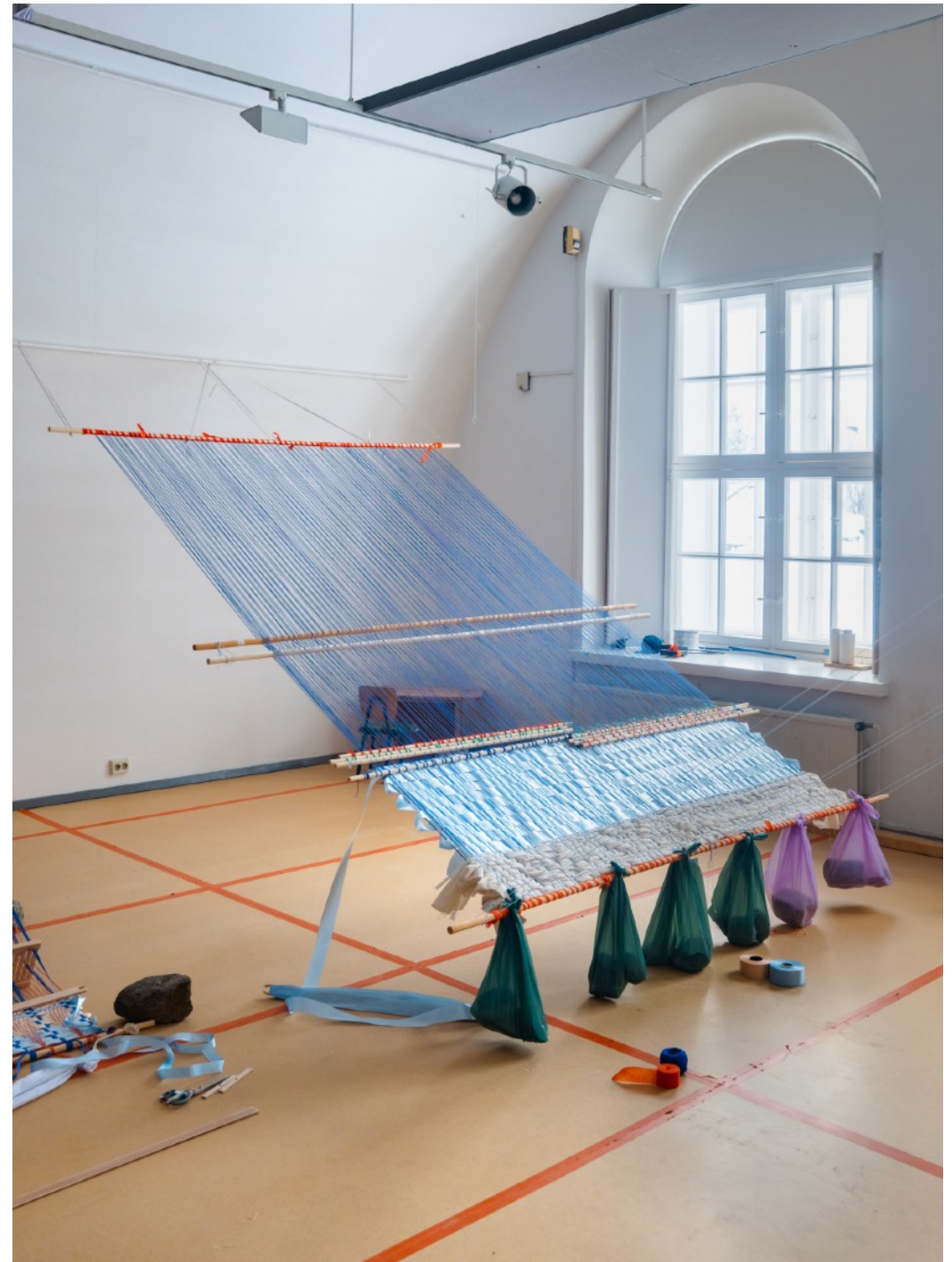
Installation view at the HIAP studio, Suomenlinna, 2022

The installation Diagonal Weighted Loom is a combination of an ancient backstrap loom and a warp weighted loom. The loom balances its weight between the existing wall structures in the HIAP studio using stones placed in plastic bags. The weaving systems are divided into two parts on the loom, allowing me to control the whole loom by myself.