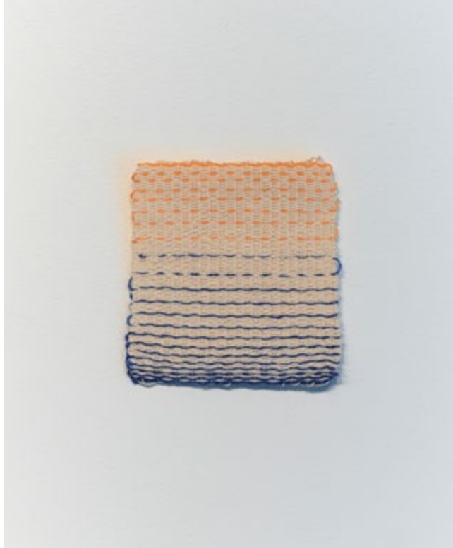
Sunset at Postbryggan in Eckerö Hand-weaving, w 9 x h 10 cm, 2019