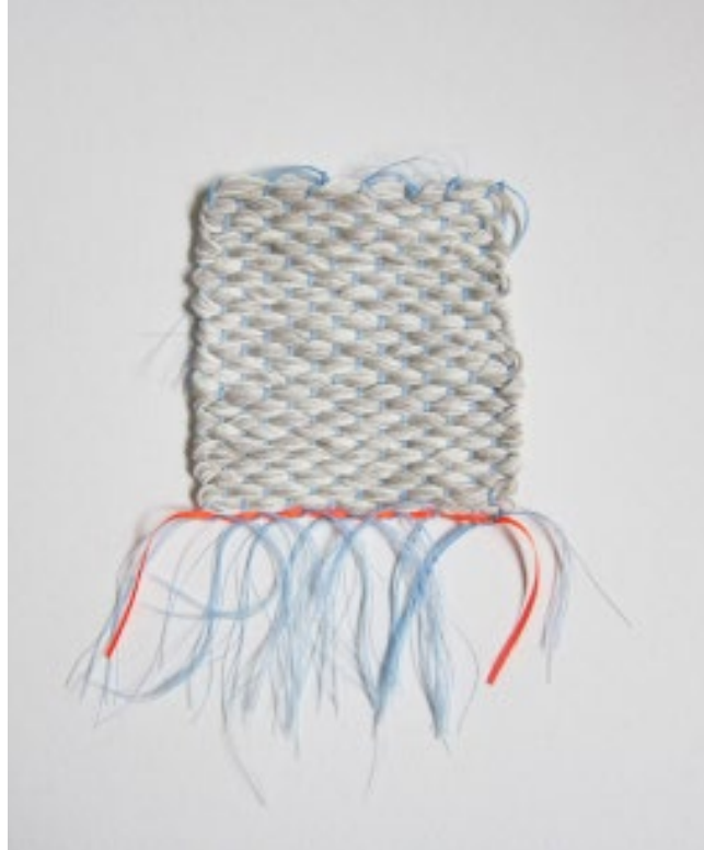
Sunny Morning Hand-weaving, w 12 x h 19 cm, 2019