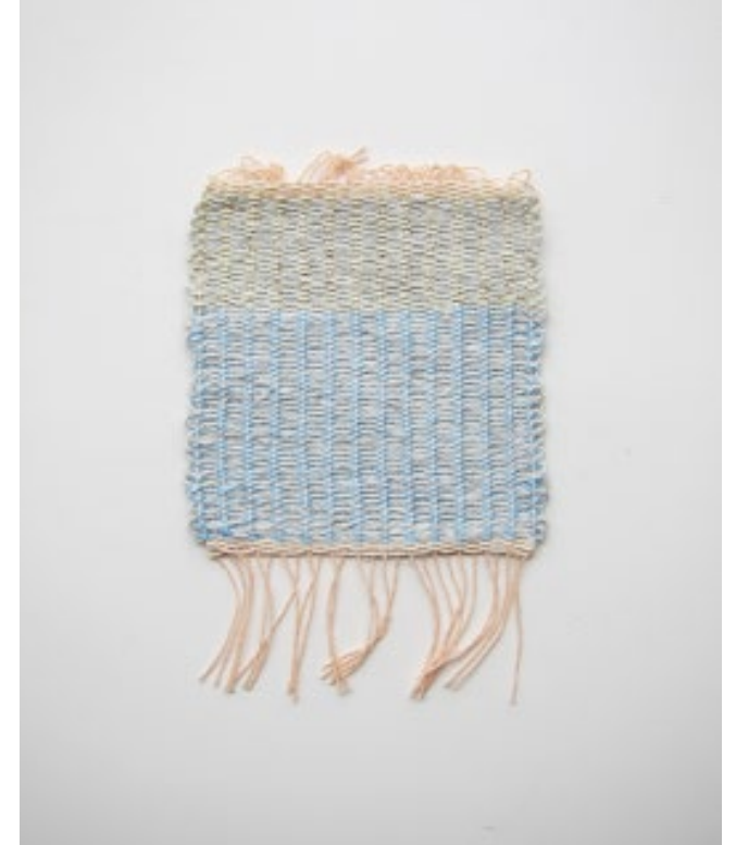
Sunset over the Sea Hand-weaving, w 11 x h 16 cm, 2019