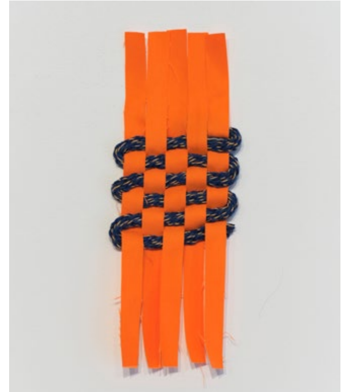
Orange, Blue, Rosa Hand-weaving and hand plying, w 9.5 x h 25 cm, 2019