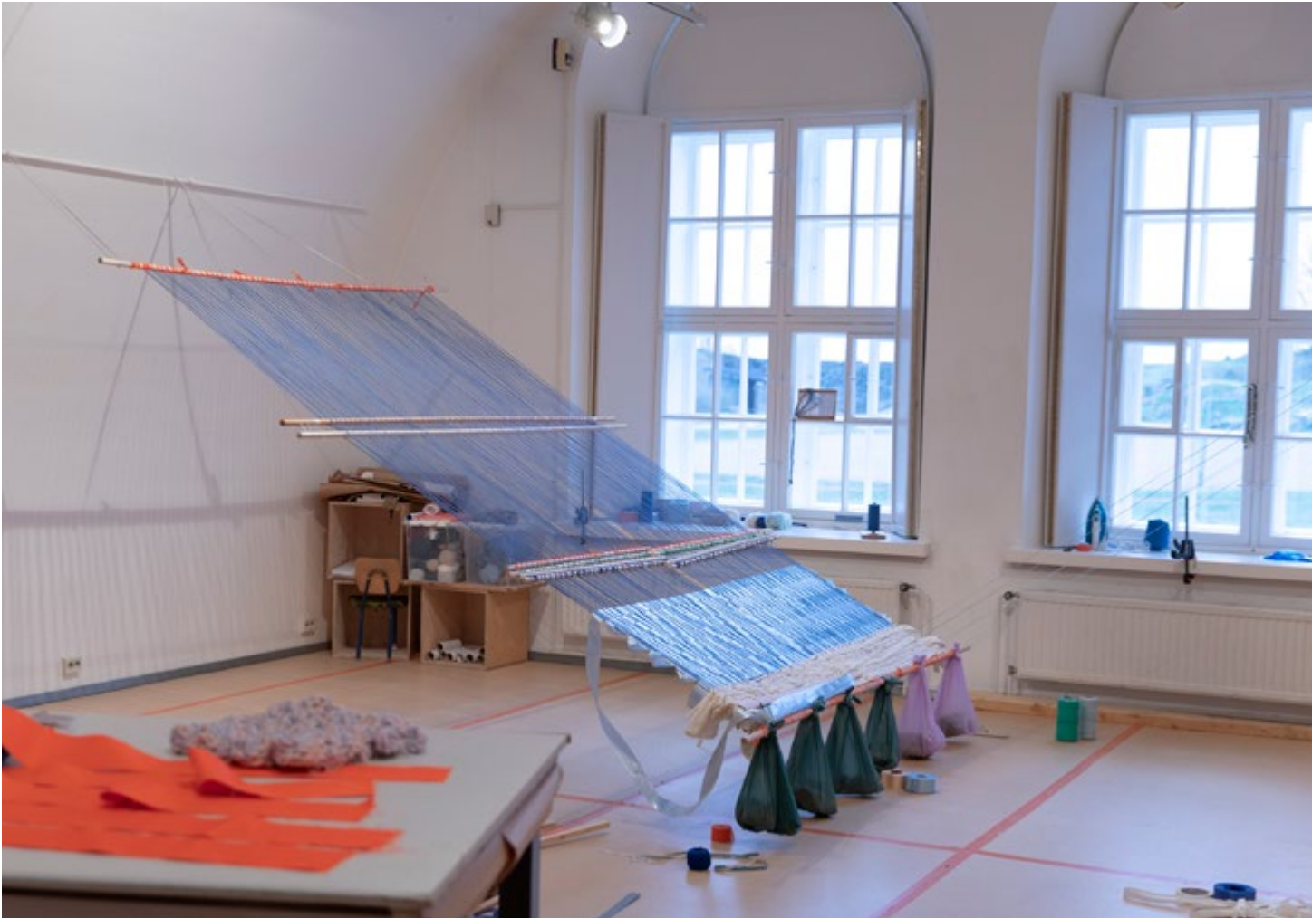
Installation view at HIAP Open Studios Autumn Season, Suomenlinna, 2022

Diagonal Weighted Loom is a combination of ancient backstrap loom and warp weighted loom. The loom is balancing its weight between the existing wall structures at my HIAP studio. The weaving systems are divided into two parts on the loom, thus I can control the whole loom by myself.