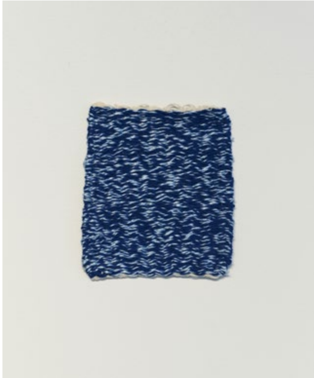
Seascape from Harakka Island Hand-weaving, w 19 x h 20 cm, 2019