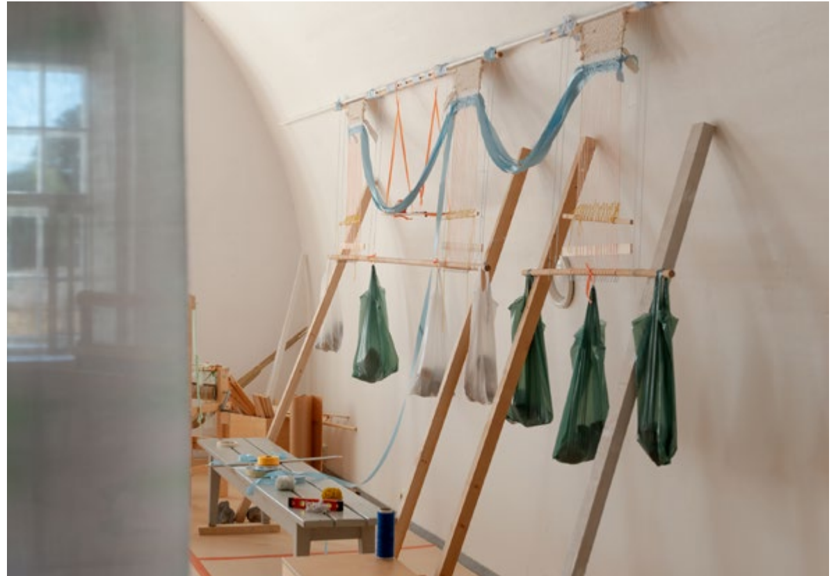
Installation view at HIAP Open Studios Summer Season, Suomenlinna, 2022

I have created a site-specific warp weighted loom inspired by the Icelandic loom from the Viking Age. As a contemporary version, I built simple structures with leftover wood materials from the wood workshop and used stones in the plastic bags as weight.