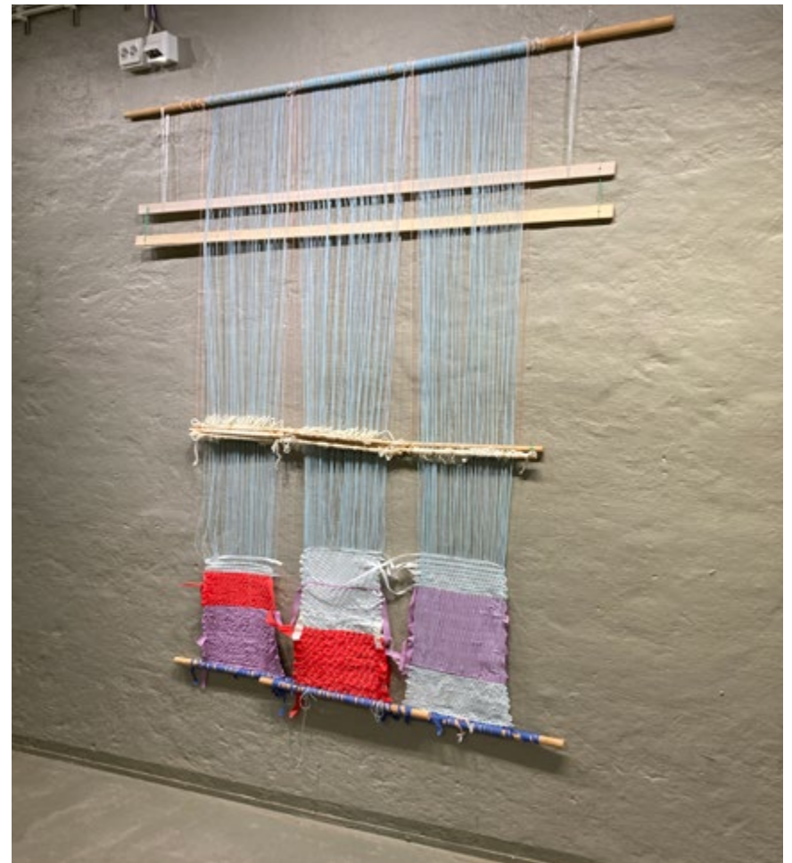
Loom 3 - w 200 cm h 190 cm