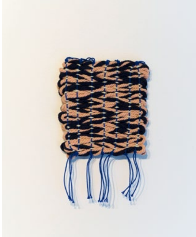
Evening Reflection Hand-weaving, w 10.5 x h 12 cm, 2019