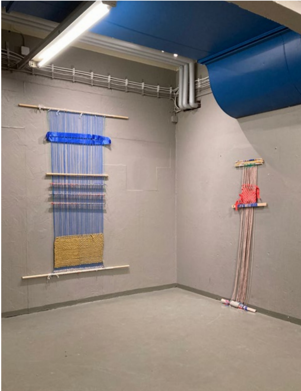
Loom 1 on the left - w 120 cm h 200 cm Loom 2 on the right - w 65 cm h 230 cm

The solo exhibition THIS IS HOW I WEAVE showcases my latest selfmade backstrap looms in order to present my technical understanding of and my dreamlike thought about hand-weaving techniques.