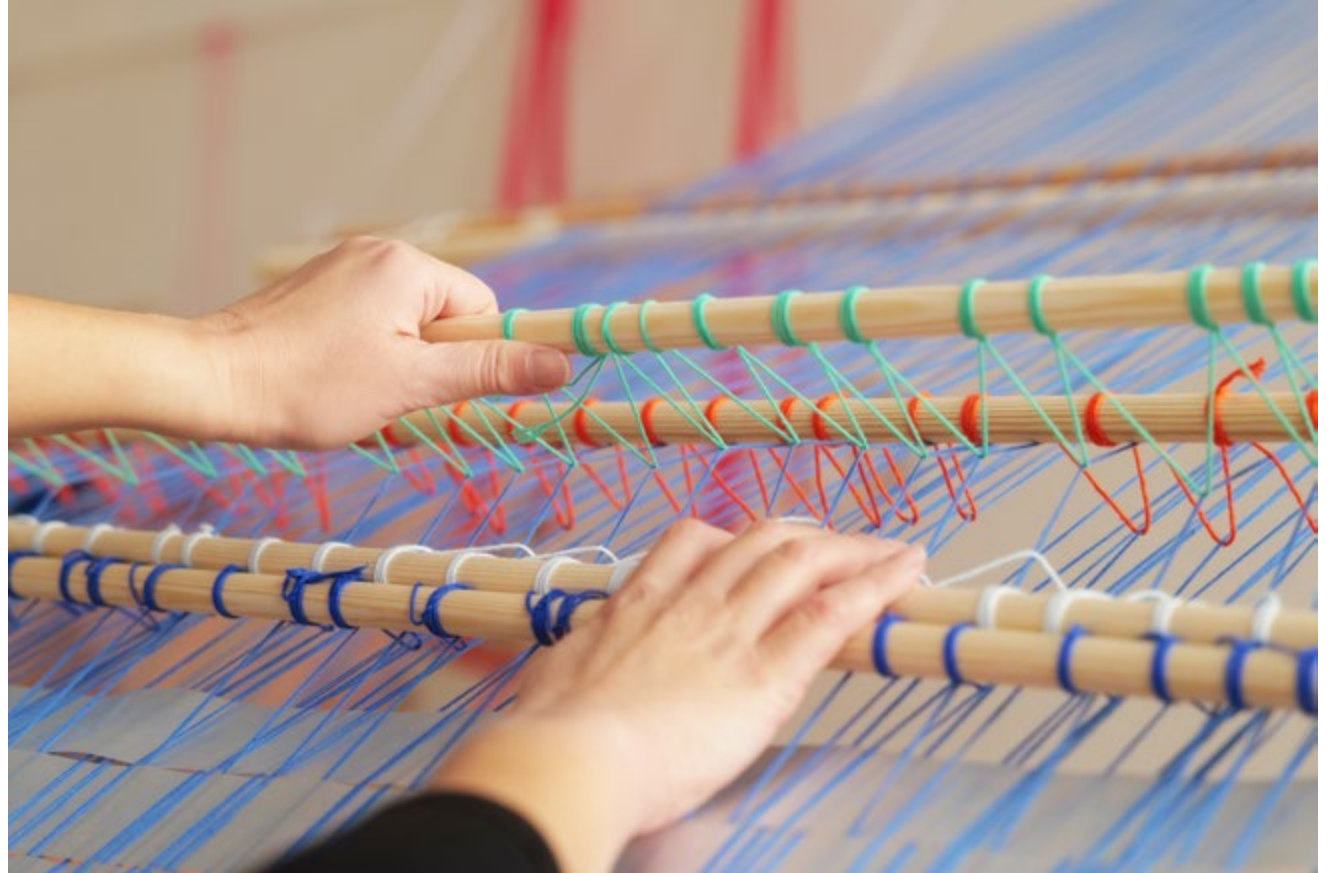
Details of the loom installation at HIAP Open Studios Autumn Season, Suomenlinna, 2022